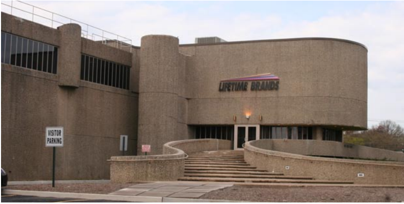
Lifetime Brands' new headquarters at 1000 Stewart Avenue, Garden City, NY

Advance Commercial Movers recently completed the relocation of one of the top-100 companies on Long Island, Lifetime Brands, Inc. Lifetime Brands, Inc., is a publicly traded company and a leading designer, developer and marketer of a broad range of nationally branded consumer products used in the home. As a part of their long-term growth strategy, the staff of Lifetime Brands, Inc., needed additional space and decided to leave their headquarters in Westbury for the spacious 114,474 square feet of space in the Business and Research Center in Garden City. Their new building at 1000 Stewart Avenue is a mixed-use redevelopment that was formerly the Bristol Myers-Squibb Pharma building.