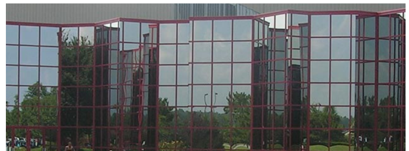
Lillian Vernon's new sprawling headquarters in Virginia Beach, VA

Lillian Vernon is a well-known national catalog and online retailer that has been serving its dedicated customers for over 56 years. The company markets gift, household, children's and fashion accessory products. With specializations in personalization, celebration and organization, Lillian Vernon is a household name and a part of popular American culture. Its corporate headquarters was located in Rye and later in White Plains, New York. However, with their call and national distribution centers already operating in Virginia Beach in a sprawling 827,000 square foot facility on 62 acres,