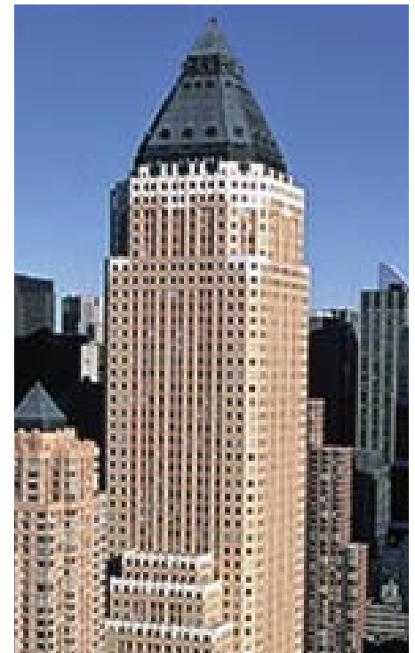
Worldwide Plaza at 825 Eighth Avenue and new base of operations for International Creative Management